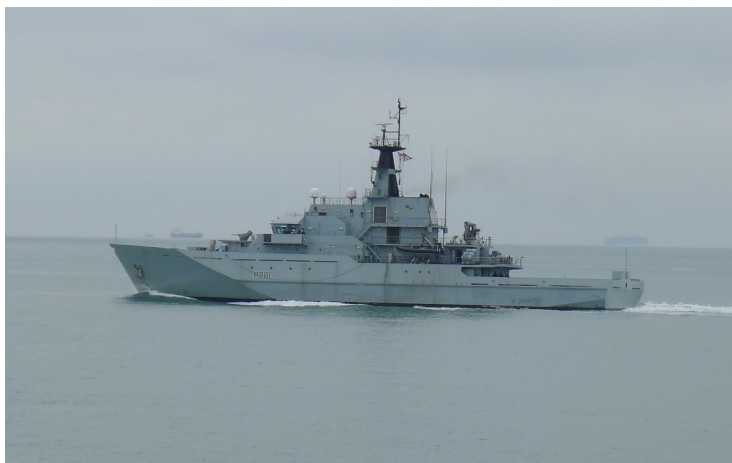
Mersey's sister ship, HMS Tyne, leaving Portsmouth